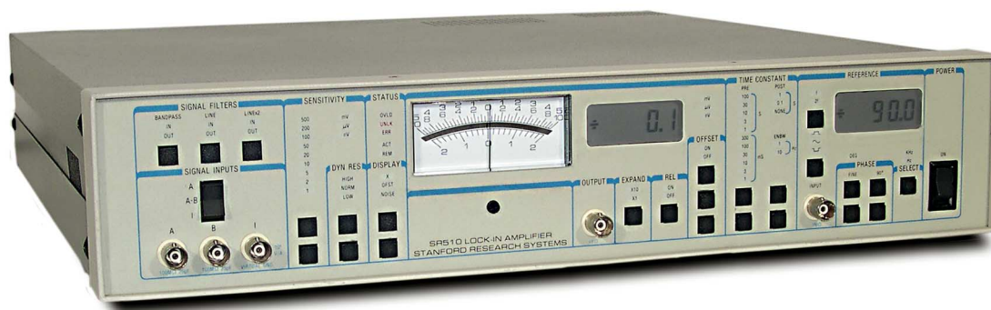
SR510 Lock-In Amplifier

An internal voltage-controlled oscillator provides both an adjustable-amplitude sine wave output and a synchronous, fixed-amplitude reference output. The sine wave amplitude can be set to 0.01, 0.1 or 1 Vrms, and it can drive up to 20 mA. The oscillator frequency is controlled by a rear-panel voltage input and can be adjusted between 1 Hz and 100 kHz. Typically, the sine wave output is used to excite some aspect of an experiment, while the reference output provides a frequency reference to the lock-in.